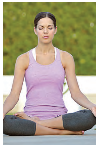
JUNIPER BERRY ESSENTIAL OIL SEE PAGE 12